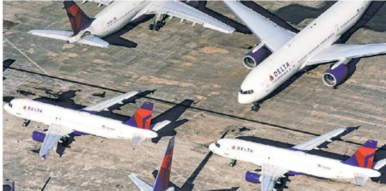
Delta stock rose 2.5% after Chief Executive Ed Bastian said the airline might return to profitability by summer.

FRIDAY, JANUARY 15, 2021 - VOL. CCLXXVII NO. 12